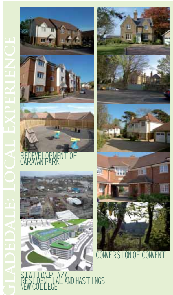
REDEVELOPMENT OF CARAVAN PARK

Ecological consultants are a key part of the team to ensure the proposals take account of, and provide for, all protected species present on the site, and to advise on future management.