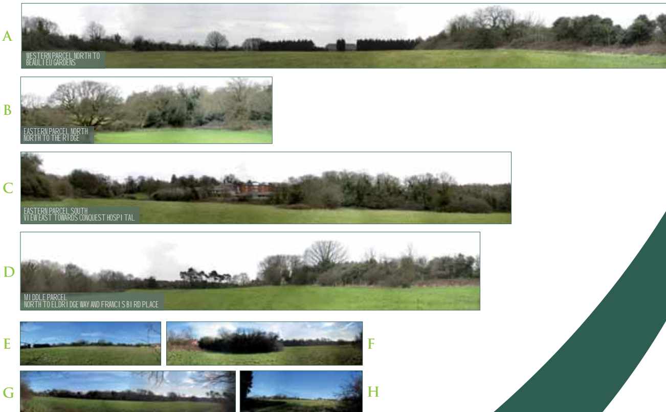
LOCATION OF PHOTOGRAPHS SHOWN ON AERIAL OF SITE

The owners of the site, the Mother Agnes Trust, are working in partnership with the Gladedale Special Projects division on the future development proposals for the Holmhurst St Mary site. These proposals are now presented for public comment. Our team is on hand to answer any questions you may have and explain the proposals in more detail.