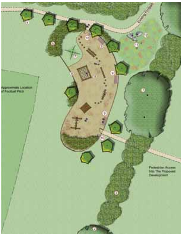
PROPOSED LOCAL EQUIPPED AREA OF PLAY (LEAP)