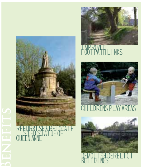
REFURBISH & RELOCATE LISTED STATUE OF QUEEN ANNE